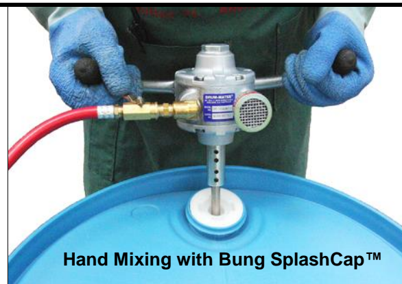
Hand Mixing with Bung SplashCap™